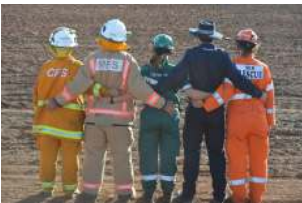
our first responders, pic taken after Pinery fire.