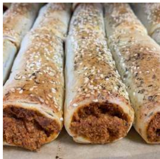
Vegan sausage rolls now available