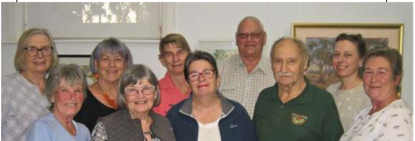
2021 KCG Committee

August is a special month on the calendar of most Artists – it's SALA (South Australia Living Artists Festival). KCG is a regular participant through the skills of its many member artists and a fantastic space in which to display the work.