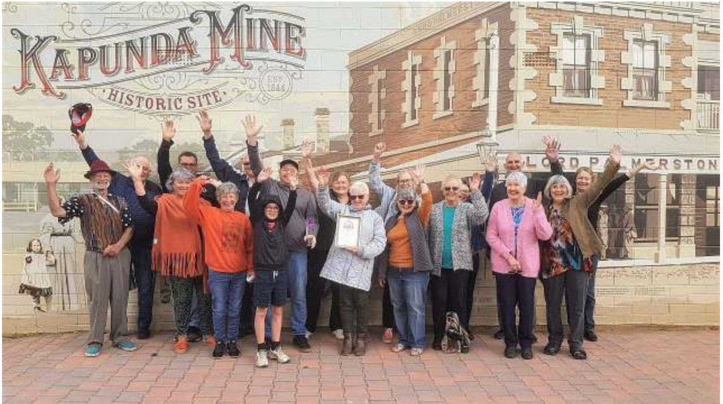
the "Lucas Street" team