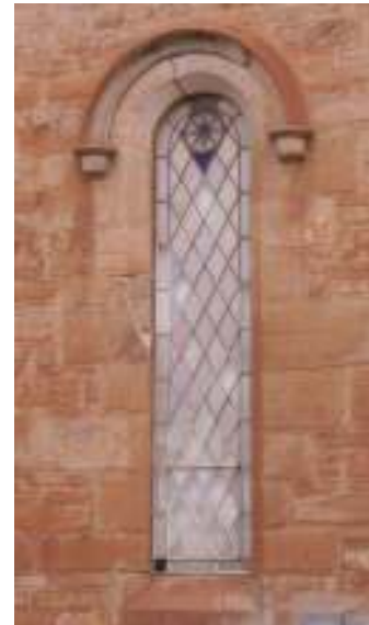
One of the original Chapel Theatre leadlight windows

Hail in Kapunda... September 30, 2021. Residents were treated to a spectacular, but unnerving hail storm that left the town blanketed in white.